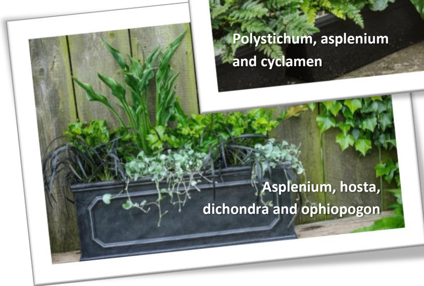
Asplenium, hosta, dichondra and ophiopogon