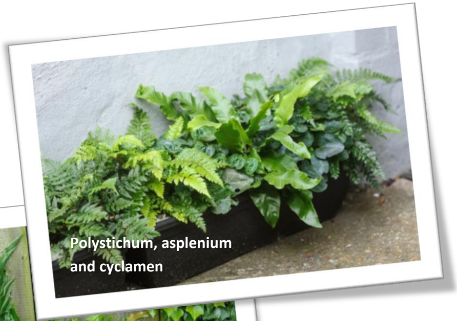
Polystichum, asplenium and cyclamen